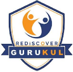
Rediscover Gurukul Academy